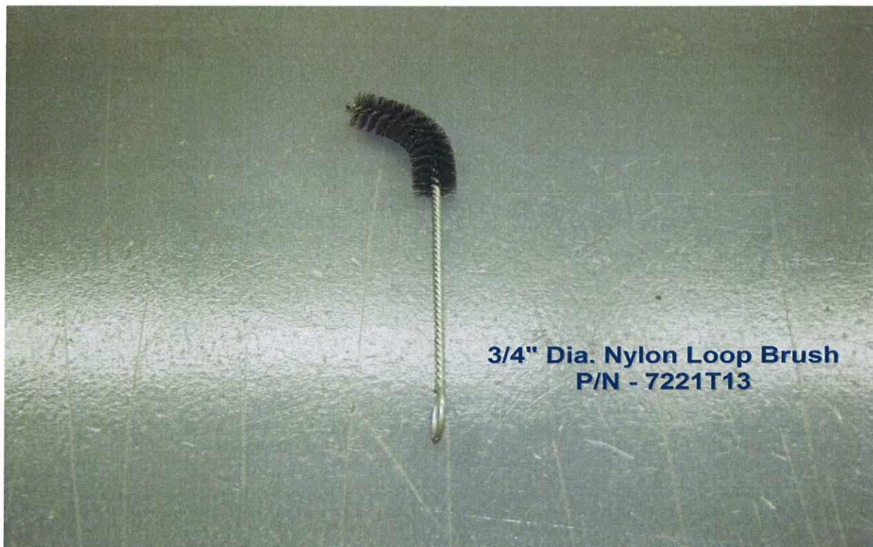
Figure 3 shows the 3/4" Nylon Loop Brush with the bend made to fit the contour of the Discharge Tube.