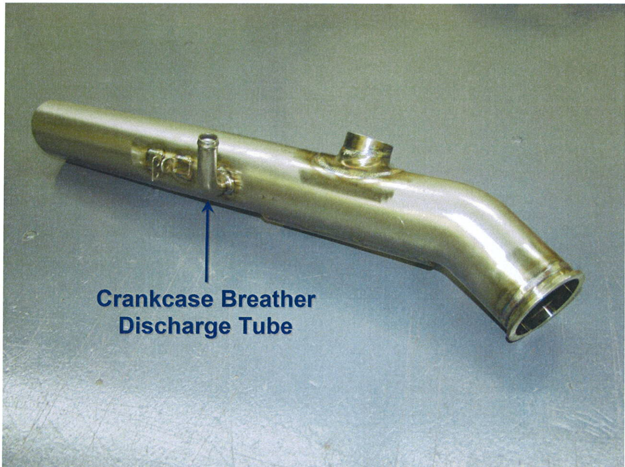
Figure 1 shows the Left Side SR22 tailpipe with the Crankcase Breather Discharge Tube.