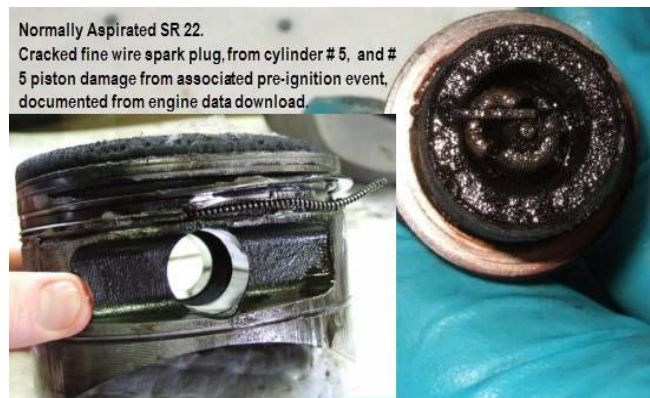
Figure 2. See associated engine monitor data in Figure 4, below.