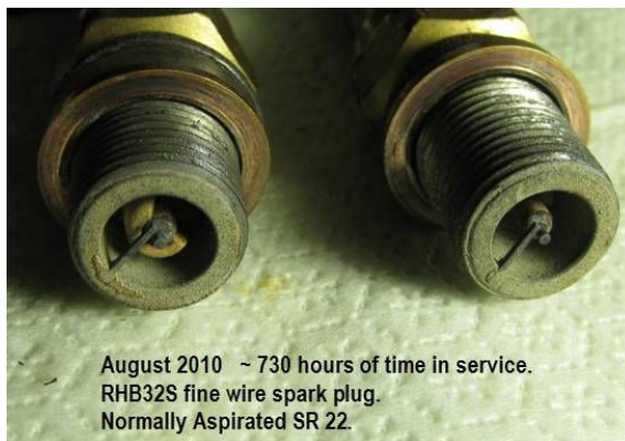
Figure 1. An example of two cracked fine wire RHB32S spark plugs from one engine.

Cracked and damaged ceramic insulators on spark plugs are known to be a common cause of preignition type combustion events in aircraft piston engines. Preignition combustion events are the most destructive combustion process known to affect piston engines.